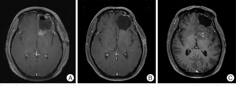
Fig. 3. Gadolinium-enhanced MRI of a patient with pseudoresponse (patient 4 of Table 3). The patient had enhancing lesion at posterior resection margin located at left basal ganglia and insula [A, 2 weeks before bevacizumab (BVZ)]. The lesion had nearly disappeared after the administration of BVZ (B). A month after discontinuation of BVZ, rapid progression with edema was seen in MRI (C). The lesion was confirmed as a true progression in subsequent surgical resection.

RANO criteria were suggested to overcome the limitation of Macdonald criteria and drew considerable attentions. Although it provides innovative assessment in the treatment of malignant glioma, yet several limitations were pointed out as discriminating true or false lesions in non-enhancing lesions, too simple tumor size measurement, and not reflecting any of new imaging techniques<sup>14)</sup>. Despite current criteria as Macdonald or RANO, purely objective judgement of treatment response only with imaging is difficult in practice. Increased CBV/CBF and a decreased ADC value do not imply progressive disease at all times, however, the decisions are made from these novel imaging modalities for most of the confusing cases. Also, interpreting nonenhanced lesions has raised another dilemma in clinical practices. Latest imaging techniques as dynamic susceptibility contrast MRI perfusion, diffusion-weighted MRI, MRI/PET scans using biomarker, and thallium single photon emission CT are introduced but no comparison under prospective studies have been performed<sup>2,13,29)</sup>. Thus, disparity sometimes in clinical judgment between oncologists and radiologists makes further treatment