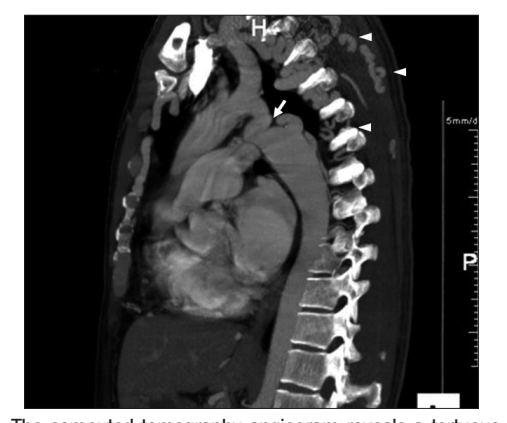
Fig. 2. The computed tomography angiogram reveals a tortuous aortic coarctation (white arrow) with an extensive network of collaterals (arrowheads).