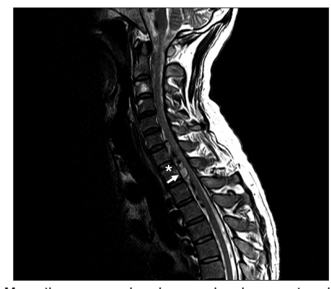
Fig. 1. Magnetic resonance imaging reveals a large acute spinal subarachnoid hematoma extending from C2 to T4 with spinal cord compression and numerous dilated anterior spinal arteries at the C6–T3 levels (white asterisk).

The patient underwent aortobifemoral bypass surgery performed by a vascular surgeon. However, he died 2 days later as a result of multiple organ failure caused by compartment syndrome.