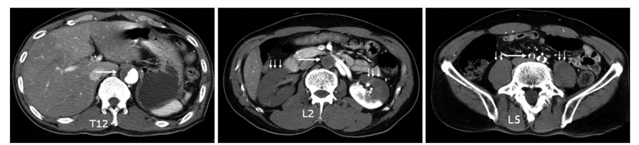
Fig. 5. The axial computed tomography angiography of the abdominal aorta and lower extremities reveal aortoiliac thrombotic occlusion (large arrow) and renal infarction (small arrows).

tential that is a suitable primary imaging method for patients with spontaneous paraparesis. However, MRI images cannot reliably identify the blood/arachnoid interface when they are in close proximity. Moreover, as in cases of ventral hematoma, it is not possible to determine whether the hematoma is located in the epidural, subdural, and subarachnoid space.