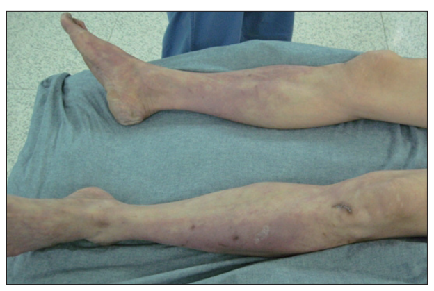
Fig. 4. The patient exhibited pallor and livedo reticularis in his lower extremities.