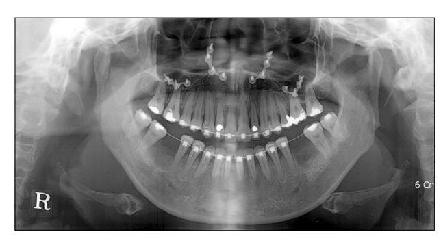
Fig. 4. Three months after removal of necrotic bone. Post-operative panoramic radiograph.

Necrosis of the proximal segment after TOVRO is ex-