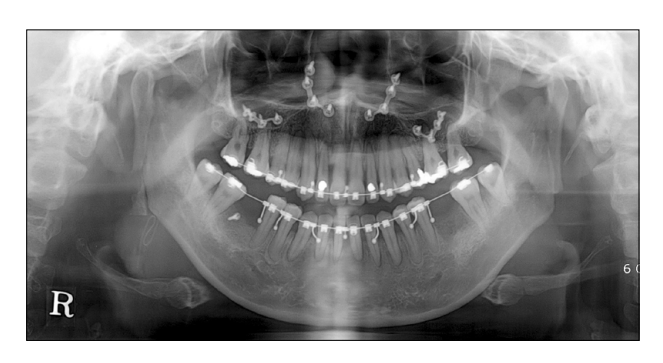
Fig. 2. Ten weeks after the orthognathic surgery, panoramic radiograph, showing discontinuity of proximal segment by radiolucent lesion.

graph and computed tomography (Fig. 2, 3) that demonstrates radiolucency and destructive bony change at the angle of right mandible with an evidence of sequestering bony segment. The patient was started on intravenous antibiotics (combination of 3rd generation cephalosporin and Metronidazole) upon admission, and she was taken to the operating room for removal of the sequestered bony segment and a drain placement. Intra-operatively, an approximately 15 mm sequestrum at the inferior aspect of the proximal segment was noted and removed. A three month post-operative panoramic radiograph (Fig. 4) was unremarkable, with resolution of symptoms.