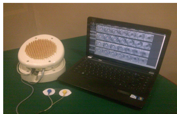
Figure 1. The Electrical Impedance Computer Mammograph MEIK Device Consists of a Portable PC, A Transducer with 256 Electrodes Arranged in Square Matrix

The visual interpretation of EIT images was conducted by a radiologist with minimum of three years experience using BI-EIM classification. A set of thirty blinded EIT images was reinterpreted to determine the intra-rater reliability or consistency in the reporting using Kappa value. \kappa \geq 0.8 was considered perfect, \kappa = 0.61-0.8 was considered good, \kappa = 0.41-0.60 was considered moderate, \kappa = 0.21-0.40 was considered fair, and \kappa \leq 0.20 was