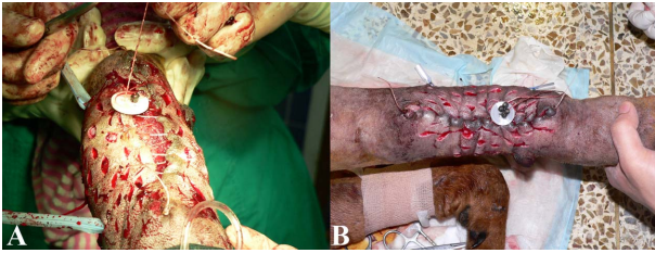
Fig. 2. Intraoperative view. (A) An adjustable horizontal mattress suture was placed using a sewing button and split shot. (B) The wound could be apposed 6 days after the operation.

Inj; MyungMoon Pharm, Korea). General anesthesia was induced with propofol (6 mg/kg IV, Anepol IN; HaNa Pharm, Korea) and was maintained with isoflurane (Forane Soln; JW pharmaceutical, Korea) delivered in oxygen. Cephalexin (22 mg/kg IV q 2 h, Methilexin Inj; Union Korea Pharm, Korea) was administered prior to induction of anesthesia.