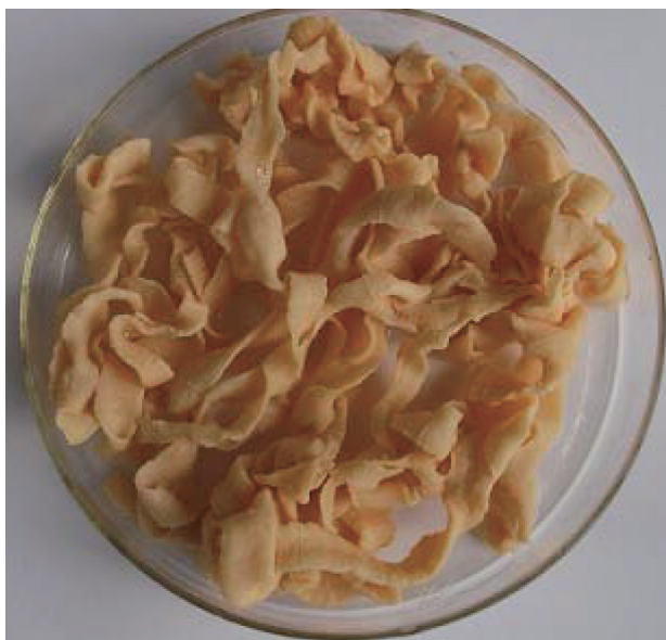
Fig. 1. Adult Taenia tapeworms collected from a patient. Scale= 2.5 cm.

There are hundreds of cysticercosis patients treated in the clinic of National Institute of Malariology, Parasitology and Entomology (NIMPE) every year. For example, during 1996-1997, 633 were cysticercosis (15.8%) patients out of 4,017 in-patients admitted to the NIMPE Clinic, and in 2010, 229 cysticercosis patients were diagnosed out of 1,524 parasitic in-patients (15.0%) [8,12].