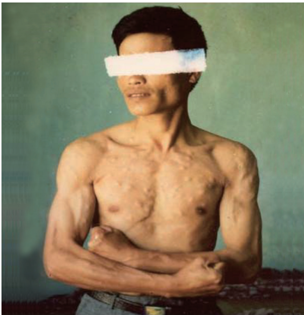
Fig. 3. Subcutaneous nodules of a cysticercosis patient with about 300 recovered cysts in total (reproduced from [12]).

The major symptoms of human cysticercosis included headache 65.9-90.4%, epilepsy 56.4-67.5%, quickened muscle 35.3-48.9%, losing memories 42.4-46.9%, sleeplessness 40.3-46.4%, hearing disorders 36.4-42.4%, nausea/vomiting 39.2-40.8%, paralysis 28.4-30.8%, feeling disorder 18.2-20.1%, biopsy positives in subcutaneous tissues 92.2-95.4%, increased eosinophils 83.4-84.5%, positive ELISA with Taenia antigen 85.1-86.6%, and positive MRI/CT scan with live cysts in the brain 90.1-92.2% [8,10]. Subcutaneous cysts were found in back-chest 36.6%, hands 28.7%, head-face-neck 18.2%, and