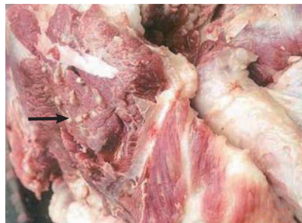
Fig. 2. Cysticercus cellulosae in pork in a market (reproduced from [8]).

The latrine present was 72.8-99.4% in the north, 62.2-96.3% in the middle, and 70.4-88.7% in the south, but defecation