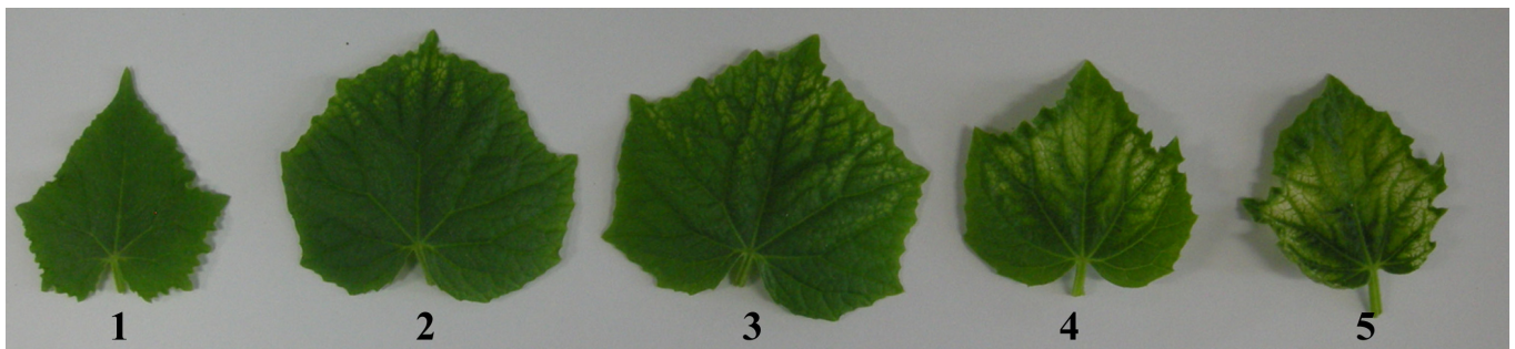
Fig. 1. Chilling damage rating of first true leaves in cucumber ( Cucumis sativus L.). 1, no damage; 2, slight; 3, moderate; 4, advanced; and 5, severe damage.