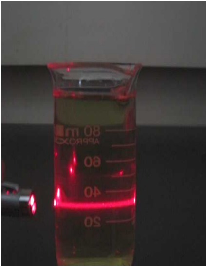
Fig. 1. Tyndall effect of clarified green liquor.