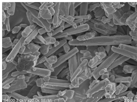
Fig. 5. SEM photographs of Needle-like CCCs (20000×).