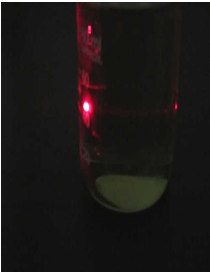
Fig. 2 Tyndall effect of clarified green liquor after sol-gel method treatment.

effect, as Fig. 1 and Fig. 2. From the Fig. 1, there is colloid in clarified green liquor due to the Tyndall effect