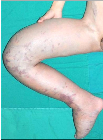
Fig. 1. Photo of arteriovenous malformation of right lower limb.

operative bleeding. For embolization, the radiologist performed catheterization through the left common femoral artery and installed a tourniquet over the right proximal thigh. Soon after, remarkable bradycardia developed due to a baroreceptor reflex-induced abrupt increase in the systemic vascular resistance (SVR), and this procedure was cancelled. After a thorough discussion with the plastic surgeons, orthopedic surgeons, and vascular surgeons, right hip disarticulation was considered to be the best option for improving the patient's quality of life. It was anticipated that the large feeding vessel branches of the right profunda femoris artery, superficial femoral artery, and the large veins draining the limb would be difficult to control during a hip disarticulation. To minimize the chances of torrential hemorrhage, a disarticulation was planned under cardiopulmonary bypass.