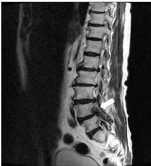
Fig. 2. Sagittal view of magnetic resonance imaging showing upward migrated disc material into foramen level. White arrow indicates the protruded disc material.