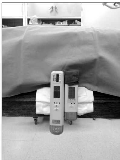
Fig. 2. The position of the two dosimeters at the side of the table. One dosimeter was wrapped with a radiation-reducing glove. Only one layer of the piece totally covered the radiation sensor of the dosimeter. Sensors were facing the patient and table.

the PDM-127 dosimeter was wrapped with a glove in 60 procedures and the PDM-227 dosimeter was wrapped with a glove in an additional 60 procedures. EDs from the dosimeters, exposure times, and the radiation absorbed doses (RADs) from the C-arm fluoroscope (OEC 9800 Plus, GE Healthcare, Salt Lake City, UT, USA), as well as the ratio of the ED from the dosimeter wrapped with a glove to the ED from the dosimeter without a glove were collected in each procedure. Data regarding patients' age, height, weight, and sex were collected by review of medical records.