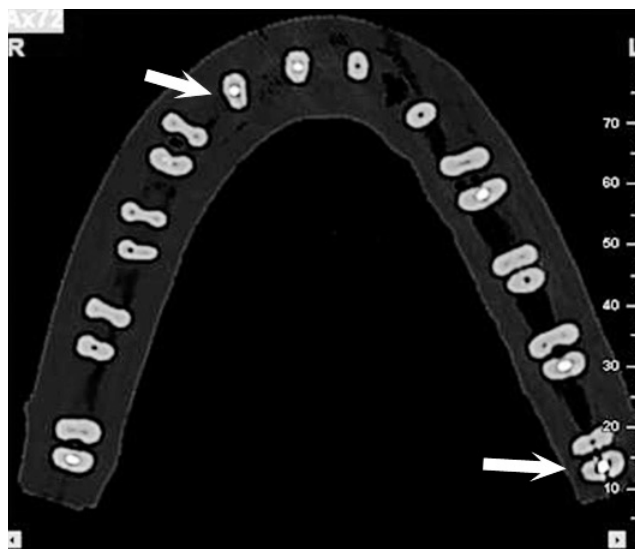
Fig. 1. An axial CBCT image shows the molar and premolar teeth with vertical root fracture.

a wax rim was made from 3 to 4 layers of wax designed on the acrylic base in the shape of the mandible.