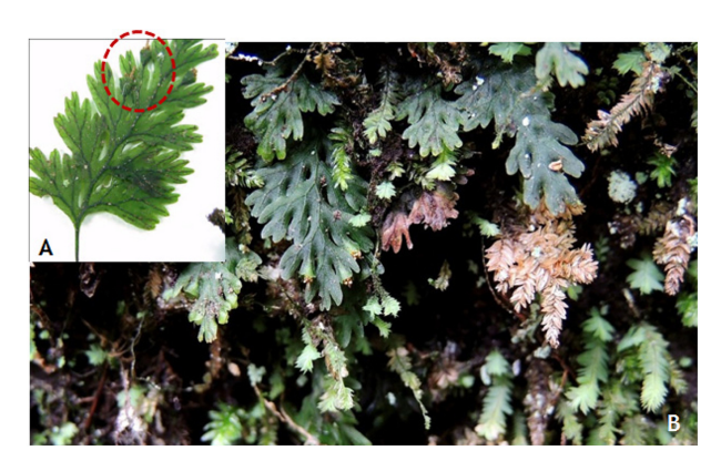
Fig. 2. Photographs of Crepidomanes schmidtianum (Zenker ex Tasch.) K. Iwats., taken in Mt. Jirisan, Baegmu-dong, Macheonmyeon, Hamyang-gun, Gyeongsangnam-do, Korea, 22 June 2013. A. Pinna with involucre and sori; B. Habit.