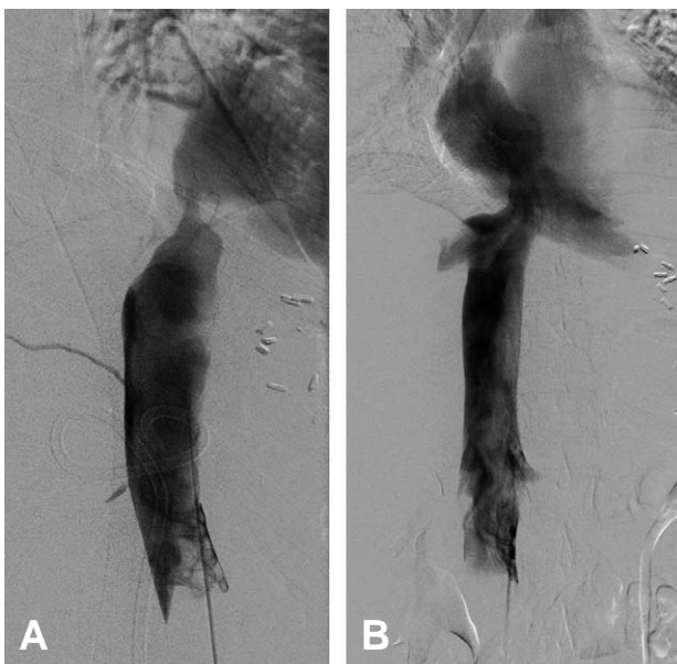
Fig. 4. (A) Initial venography showed 95% stenosis of the suprahepatic IVC with gradient pressure of 16 mmHg. (B) After PTA, the gradient pressure dropped to 4 mmHg.

To save our liver injury patient, we performed intraparenchymal and perihepatic packing, deep hepatic suture, lateral sectionectomy, and direct suture repair of IVC. It is known that direct venous repair of juxtahepatic venous injuries have very high mortality rates (9-11) but the patient has survived. Even so, as a complication of direct suture repair of the IVC, Budd-Chiari syndrome due to