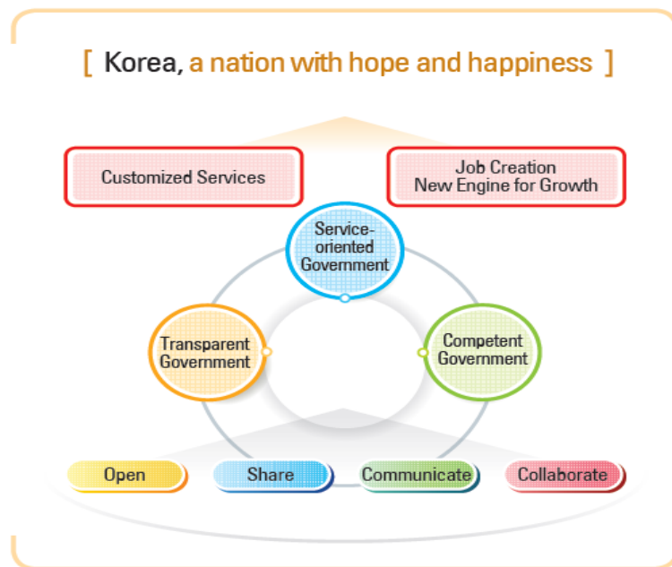
Fig. 1. Strategy for Government 3.0

In response to such the paradigm shift, a presidential nominee proposed a smart, next-generation e-government capable of providing people with services tailored to their demands during the election campaign in late 2012. After winning the presidential election, new government has come up with an action plan to bring to fruition, government 3.0. Leading on from previous similar initiatives, the new scheme seeks to focus on open, share, communicate, and collaborate.