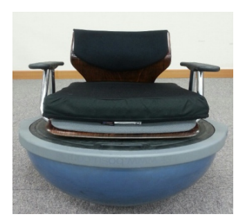
Figure 1. The actual figure of the test-balance board which developed from KOREC

For smooth backward movement, the back of the chair was removed. To prevent a falling accident, the stability guide cushion bar was installed in an effort to cope with a possible danger.