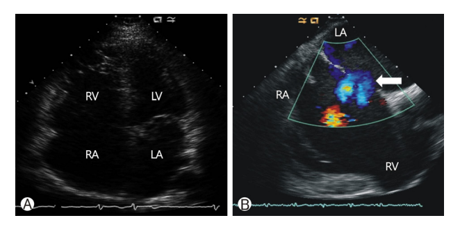
Fig. 1. Preoperative echocardiography. A 65-year-old male had a known ASD (secundum type; 2 defects; Qp/Qs=2.0; pulmonary arterial pressure=53/24 mmHg) and a persistent presence of dyspnea on exertion (New York Heart Association class II of IV). (A) The enlargement of RV and both atria, (B) Two defects of secundum type ASD on the color doppler (arrow). ASD, atrial septal defect; RV, right ventricle; LV, left ventricle; RA, right atrium; LA, left atrium.

On admission 2 days, the patient successfully underwent ASD closure and left atrial appendage obliteration. Imme-