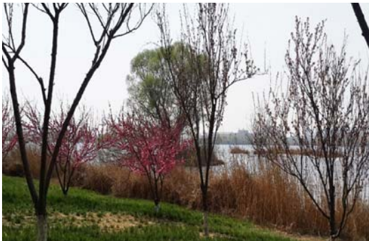
Fig.4. After the design of Nanhu park.