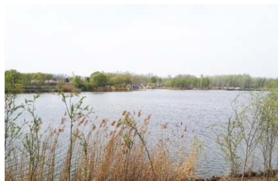
Fig.3. After the design of Nanhu park.

Nanhu National Urban Wetland Park has a remarkable achievement in improvement of the urban environment and the quality of life (Fig. 3, 4). However, because to the wetland landscape's value and ecosystem service understanding insufficiency, had many problems in the construction. It has lead to excessive exploitation and utilization of the wetland. For example, construction of the Spa Hotel, National Sport Base, Development of international golf club, luxury villas and a series of commercial activities inside the wetland park. We must take measures to protect the wetland landscape that in the park.