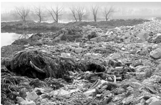
Fig.2. Before the renovation of the Nanhu park.