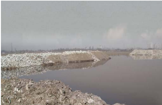
Fig.1. Before the renovation of the Nanhu park.

respectively for the two periods: from 1997 to 2005. It was called Construction of Nanhu park. The other is after 2005. Nanhu district afforded the main construction, such as newly-built roads, newly constructed building, commercial center and parks.