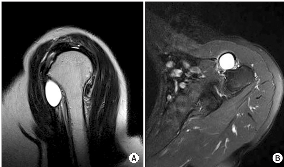
Fig. 1. (A) The sagittal view of T2 weighted image of magnetic resonance imaging (MRI) shows oval cystic mass with high signal intensity, just distal to the greater tubercle. (B) The axial view of T2 weighted image of MRI shows thinning of the long head of biceps brachii tendon around the cystic mass.