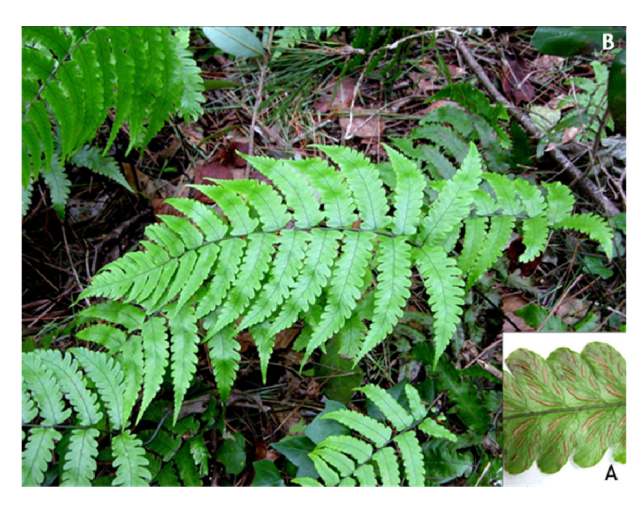
Fig. 2. Photographs of Diplazium mettenianum (Miq.) C. Chr. var. mettenianum , taken in a forest at Min-oreum, Jeju-do, Korea, 7 Sept. 2012. A. Pinna with involucre and sori; B. Habit.