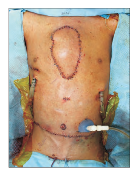
Fig. 4. An immediate postoperative view.

For soft tissue coverage of the sternal defect, a TRAM flap was planned. Because the defect size was determined to be 11\times7 cm (Fig. 1), and considering that the donor site needed to be enough to obtain primary closure, we designed the