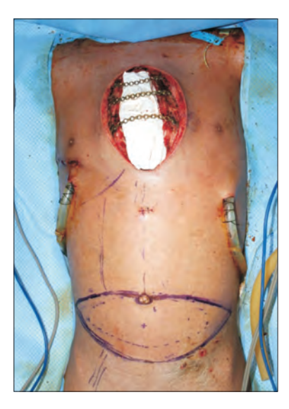
Fig. 2. The preoperative design of the transverse rectus abdominis myocutaneous flap.

using the orthotopic transplantation method on March 11, 2012. The first operation was completed with the sternum left open because it was pressing against the transplanted heart. Nine days after the first procedure, sternal reconstruction was performed. Four titanium plates were placed across the sternum and ribs using screws so that the lower sternal body could be fixed with enough space.