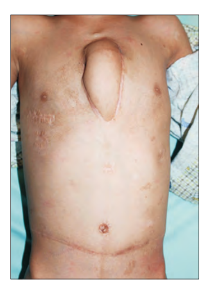
Fig. 5. A postoperative view of the patient, 14 weeks after the reconstruction.

donor site fascial repair was performed with a double horizontal mattress suture and fascial plication.