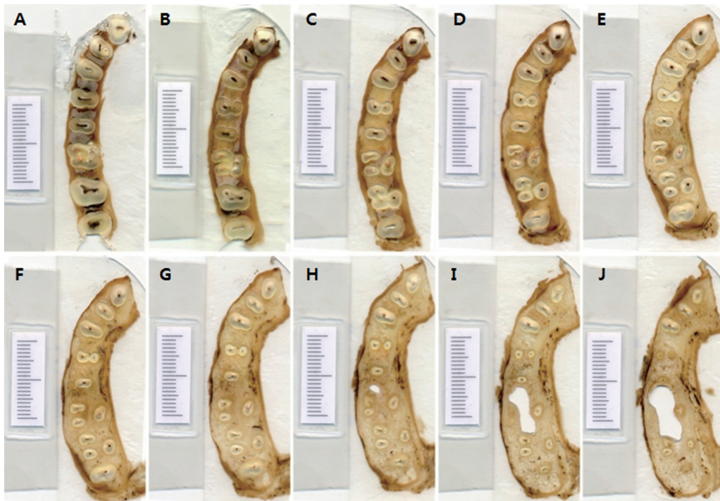
Fig. 1. Sectioned specimens of the maxillary arch from 1 mm (upper left) to 10 mm (lower right) below the cervical line. (A) (upper left): 1 mm below the cervical line, (J) (lower right): 10 mm below the cervical line.

Jaw cross sections were analyzed in 20 maxillae (14 males, 6 females; mean age 66.1 years, age range 45-80 years). All specimens had normal occlusion and normal teeth alignment. Resin blocks were produced by dehydrating the specimens using a conventional method for 3 days before infiltrating them with a mixture of Technovit 7200 (No. 51000, EXAKT Co., Norderstedt, Germany) and 100% alcohol. The infiltrated samples were placed in an embedding mold and then polymerized using a light with 450 nm wave length in a light-curing unit (520 light polymerization unit, EXAKT Co., Norderstedt, Germany) for 1 day. The resin blocks were cut serially at 1 mm intervals from the cervical line to the root apex using Macro Cutting & Band System (300CP, EXAKT Co., Norderstedt, Germany). Images of each section were then obtained at a resolution of 600 DPI using a computer scanner (Perfection 3490 Photo, EPSON Co., Nagano, Japan) and stored in TIF format with high-quality compression (Fig. 1).