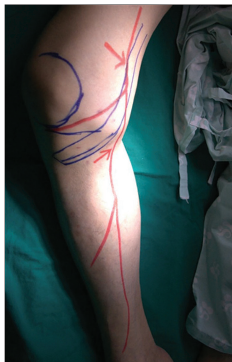
Fig. 1. The entry points (red arrows) of the radiofrequency needle inserted to block the saphenous nerve (red free line) are illustrated on the right leg. The right side was positioned with a hip external rotation, a hip abduction, and a knee flexion.

The saphenous nerve is the terminal sensory branch of the femoral nerve. It supplies sensation to the anteromedial aspect of the leg. The saphenous nerve originates from the femoral nerve in the inguinal region and travels with the femoral artery and vein down into the adductor canal. At the end of the canal, it emerges through the aponeurotic covering, travels along the medial side of the knee behind the sartorius muscle, and then pierces the fascia lata between the tendons of the sartorius and gracilis muscles. Around the medial knee, the infrapatellar nerve