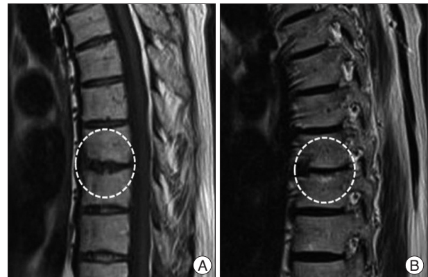
Fig. 1. Thoracic MRI of a 73-year-old man with mixed type Modic change (type I/II) at T9-10. A : Sagittal T1-weighted image revealing high signal intensity of the lower endplate of T9 and low signal intensity of the upper endplate of T10. B : Sagittal T2-weighted image showing high signal intensity of both endplates at T9-10.

The prevalence of MC in patients with a degenerative disc disease of the lumbar spine ranges has been reported to range from 19 to 59% 13,17,19,20 . Two recent studies on MC in cervical spine reported prevalence of 16% and 40.4%, respectively, which are similar to values for the lumbar spine 10,15 . In the present