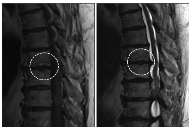
Fig. 3. Thoracic MRI of an 80-year-old woman exhibiting a type II Modic change and disc herniation at T8-9.

During recent years, MCs have been investigated as a cause of non-specific LBP 2,5,6,8) , and type I MC has been