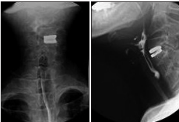
Fig. 4. Contrast study performed at 13th day after surgery reveal the leakage, which was observed before surgery is absent.

muscle, but severe inflammation prevented its use. Consequently, Tissel® was spread on the surgical site before the tube was inserted for drainage. On the 10th day after the operation, the drainage tube was removed. An esophagogram conducted on the 13th day after the operation showed no contrast leakage (Fig. 4). A liquid diet was permitted 15 days after the operation. Thereafter, the patient was transferred to the plastic surgery department of our institute to receive skin graft. A full-thickness skin graft was performed before the patient was discharged from the hospital. The patient was monitored for six months after the operation and showed no sign of complications.