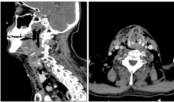
Fig. 1. Preoperative computed tomography scans show a large amount of subcutaneous emphysema in the anterior lateral cervical regions.