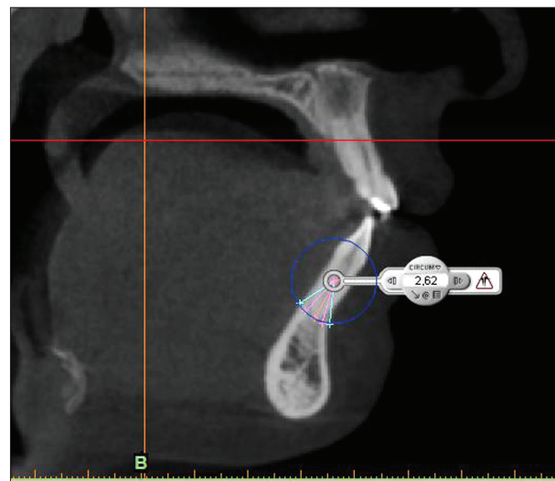
Figure 3. Arch length measurements.

Class II groups. The Kruskal–Wallis test and Dunn post-hoc test was used for subgroup comparisons. Statistical significance was tested at \alpha = 0.05 .