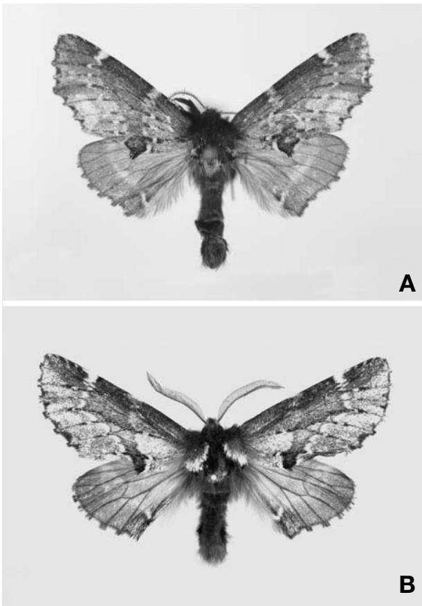
Fig. 1. Adults of Odontosia Hübner. A, Odontosia patricia ; B, Odontosia sieversii .

proboscis, thorax with dense woolly hair and scales, and elongate wings with thinly scaled forewing with strongly serrate margin. They are similar to those of Lophontosia Staudinger in the dorsally tapering central fascia of forewing and dentate distal margin of wings. However, these two genera can be separated by the wing ground color and the male and female genitalia. The male genitalia are characterized by the relatively short and hooked uncus and a pair of digitate gnathos, a medially expanded long slender membranous valva and a sclerotized harpe and the broad, shallow saccus. The male genitalia of Odontosia can be distinguished from those of Lophontosia by the relatively long and well-developed gnathos and broad saccus without medial projection. The female genitalia can be distinguished by the simple ostium bursae, the long sclerotized ductus bursae, and the large ovate corpus bursae with a patch of signa.