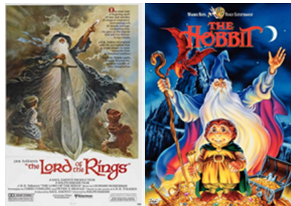
Fig. 6. The Lord of the Rings (1978) and the Hobbit (1977) Animation Version

In such digital contents-dominating circumstances, the literary genres that have been broadly highlighted and took privileged benefits to grow further are the fantasy novel and the fantasy film. In the past analogue contents atmosphere, the fantasy literature contents could not be effectively cinematized. But, CG crafted with digital technologies makes the virtual reality effects innovative in filming episodes [3].