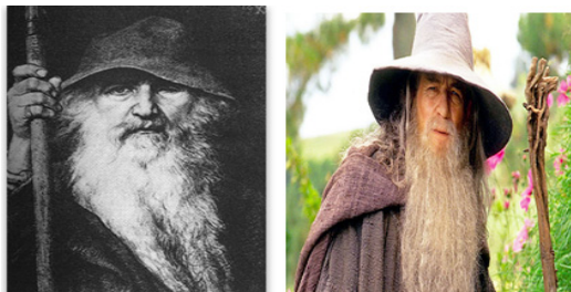
Fig. 8. Odin(left) and Gandalf(right)

Sauron, the maker of the ring, inlaid certain Elvish words into the ring, but only when it takes warmth by fire, they appear on the surface of the ring.