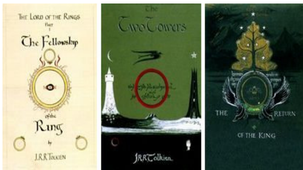
Fig. 2. J. R. R. Tolkien's The Lord of the Rings Trilogy

The Lord of the Rings Trilogy as a series of novels won the highest level of popularity in mid-1950's immediately after they were published. In 1990's, after 50 years passed since then, however, they have been almost erased, and few people happened to remember them except for those at the age of mid-forty who recognized the past glory. Among young people, Tolkien's fantasy novels were generally unread and forgotten. But, in the early 2000's, they created a great sensation and grabbed the world audiences's minds. This time occurred not in the original form of novel, but as a filmed trilogy directed by Peter Jackson (1961-present), a New Zealand movie director.