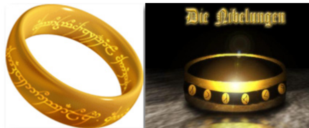
Fig. 9. The Ring in the Lord of the Rings (left) and The Ring in Ring of Nibelung (right)

The words are, “One Ring to rule them all, One Ring to find them, One Ring to bring them all and in the darkness bind them (75).” Such a catastrophic and prophetic substance is realized in Norse mythology. In the last days of the world, Jotnar delivers the deathblow to Odin and all the other gods except for Loki, and in the end, Loki's children, the great wolf Fenrir, the biggest serpent Jörmungandr, and the queen of the hell Hel destroy and imprison them all into darkness. Jotnar is the generic term of the giants and giantess in Norse mythology. They are the enemies of the gods, and thus, the Mythology is plotted with the struggles between the gods and Jotnar. Loki seems originally one of the gods in Norse mythology, but he has three children, Fenrir, Jörmungandr, and Hel with the giantess, Angrboða. Consequently Loki has been identified either a god or a giant.