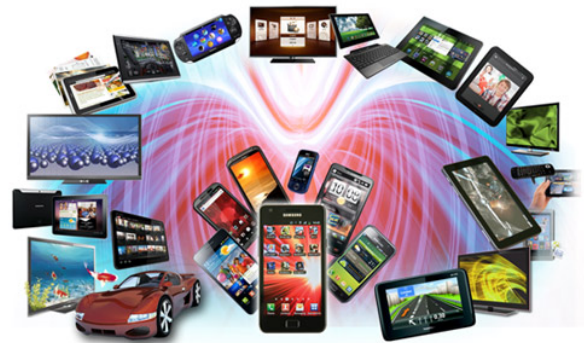
Fig. 5. Digital Multimedia, Icon of the Contemporary Culture

One primary reason is a big difference between digital contents and analogue contents in the aspect of chronological and spatial limits, which determine to create economic benefits. As an example, in comparing the typewriter, which is a symbol of the analogue age with the advanced computer today, the typewriter's capacity to produce typed or designed documents is extremely lower and much more restricted than the computer's. Any kinds of typewriters cannot surpass the computers in the word process with speedy writing, editing, saving, and filing the documents. In considering distributing and sharing them through the online network services such as email or various types of SNS like facebook, the computers in the 21 st century never allow the typewriters to weed them out and predominate the contemporary writing technology. The typewriters can never imitate the computer word process system [8].