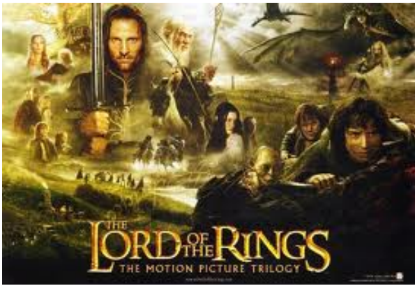
Fig. 3. The Lord of the Rings Trilogy (Film)