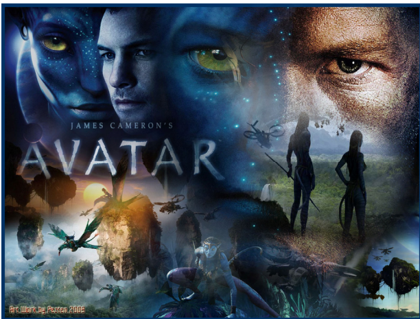
Fig. 7. The Fantasy Movie, Avatar

Like this, the digital contents technology was very excellent on giving body to mythological and heroic epic stories. In particular, along with fantasy literary works like J. K. Rowling(1965-present)'s Harry Potter (1997-2007) and C. S. Lewis(1898-1963)'s The Chronicles of Narnia (1950-1956) [1]-[2], [5], [25], The Lord of the Rings Trilogy has left a deep impression to the audience. Among them, The Lord of the Rings Trilogy seemed to gain the broadest interests from the audience because of its heroic spectacle and mythological caliber.