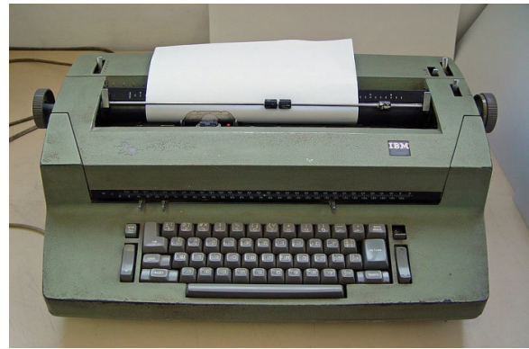
Fig. 4. Typewriter, Symbol of Analogue Culture