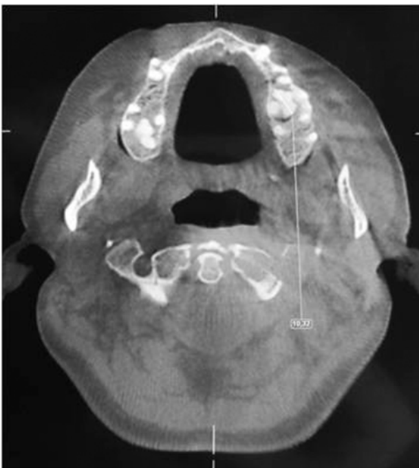
Fig. 4. An axial CBCT image shows high-density, lobulated, well-defined, expansile masses of florid osseous dysplasias in the maxilla (arrows).