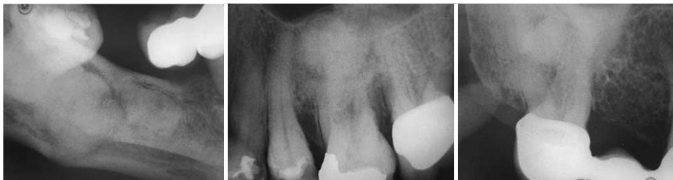
Fig. 1. Periapical radiographs reveal dense, amorphous, radiopaque masses.

plays a vital role in diagnosing these lesions. Panoramic radiographs exhibit a multi-quadrant appearance that is characteristic of these radiopaque masses. Three-dimensional (3D) radiological imaging modalities like cone-beam computed tomography (CBCT) provide more detailed information by virtue of their ability to produce axial, coronal, and sagittal views.