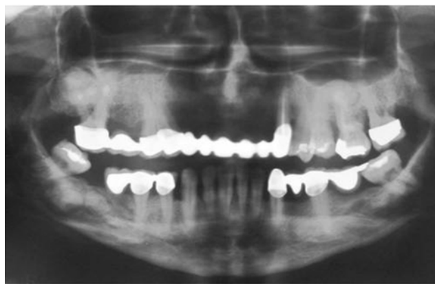
Fig. 2. A panoramic radiograph shows the mixed radiolucent/radiopaque masses with a cotton-wool appearance and with the entire border in three quadrants.

A lesion was found incidentally on routine periapical radiographs taken for the restored teeth and edentulous areas (Fig. 1). Radiopaque masses were coincidentally observed in the periapical radiographs but the exact boundaries of the masses could not be seen. For further and more detailed examination, cone-beam computed tomography (CBCT) and a panoramic radiograph were taken. The panoramic radiograph and CBCT revealed maxillary bilateral and symmetrical, well-defined, round, radiopaque masses in contact with the root of the maxillary right second molar and left first molar teeth. Lobular, irregularly shaped radiopacities with clear radiolucent demarcation were also present in the right edentulous mandibular molar area (Figs. 2 and 3). The bucco-lingual aspects of the lesions were best