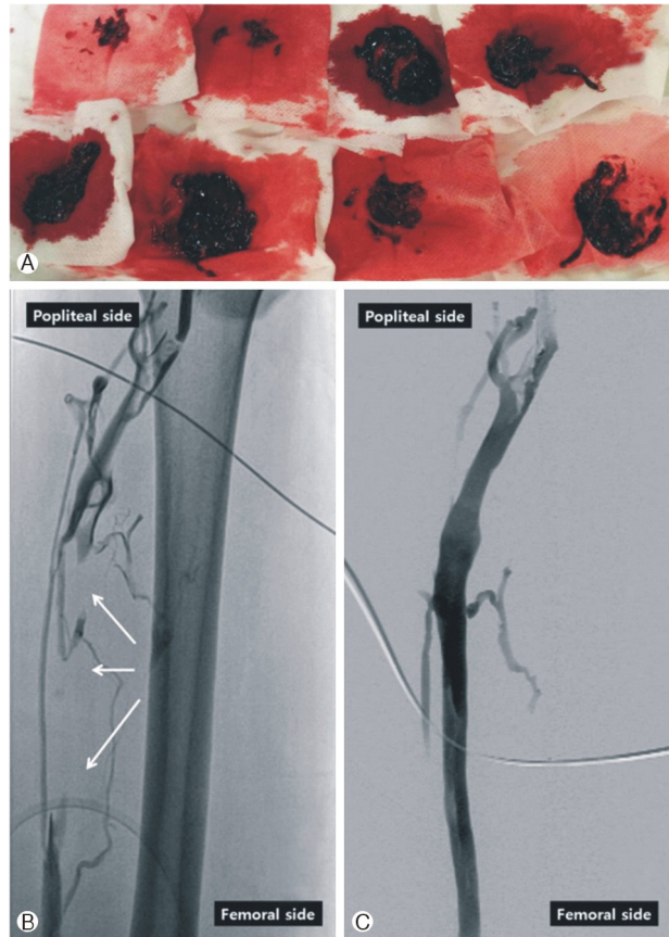
Fig. 3. (A) Extracted thrombi. (B) Venogram obtained after the mechanical thrombectomy shows rapidly developing venous thrombosis (arrows). (C) Venograms obtained after additional, catheter-directed thrombolysis show much resolved thrombi.

Vascular complications, such as bleeding, hematoma, and pseudoaneurysm, related to the femoral arterial catheterization, occur in 1.7% to 8.4% of patients. 1,5 Among these complications, major bleeding has been associated with increased mortality. Doyle et al. found that major femoral bleeding and blood transfusions were associated with a significant increase in the 30-day mortality rate. 3 In other studies, association of one-year mortality to major bleeding has been reported. Applegate et al. reported that vascular complication is an independent predictor of non-fatal myocardial infarction or death by one year, if accompanied by thrombolysis in myocardial infarction major and minor bleeding. 5 Romaguera et al. reported that vascular complications with decreased hematocrit of more than 9.2% caused an increased risk for death by one year. 4 Risk factors for femoral bleeding after catheterization include periprocedural use of heparin or fibrinolytic therapy, repeated procedures, peripheral artery disease, advanced patient age, obesity, duration of time that the sheath remains in place particularly if >15 hours, the use of an intra-aortic balloon pump, larger arterial sheath size, and cannulation of the superficial femoral artery. 8,9 Vascular closure devices, bivalirudin, a mechanical clamp, and a radial approach can, therefore, be the optimal strategies for reducing hemorrhagic complications. Although meta-analyses regar-