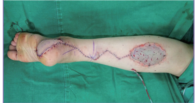
Fig. 4. Long term follow-up

The flap is transposed to the defect area by carefully rotating the flap over its pedicle up to 180°. Then the recipient site is closed, and the donor site is either primarily closed or skin grafted.