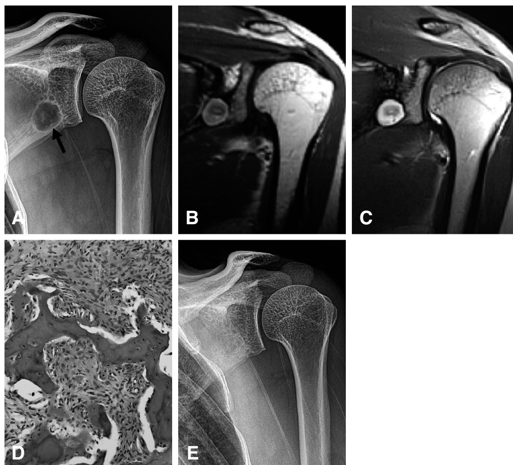
Fig. 3. (A) Radiograph shows a radiolucent unilobular osteolytic lesion with a distinct sclerotic rim in the inferior portion of the glenoid. This lesion shows dot-like heterogenous opacity suggestive of calcification (arrow). (B, C) MR imaging shows a unilobulated well-circumscribed cystic lesion at the inferior border of the glenoid neck with relatively low signal intensity on T1-weighted images and high signal intensity on T2-weighted images. The lesion shows dot-like low signal intensity suggestive of calcification. (D) Histological examination shows a large amount of marrow and curved or irregular-shaped trabeculae of woven bone which are embedded in a moderately cellular fibrous tissue. (E) Follow-up radiograph taken 1 year after operation shows complete regression of the osteolytic lesion.

it is assumed that such a location can cause pain at the posterior aspect of the shoulder. This may explain the posterior shoulder pain during arm abduction or extension in the first case. All of our 3 cases were located at the posteroinferior portion of the glenoid. However, 2 cases of intraosseous ganglion were located adjacent to the articular cartilage involving subchondral bone, while 1 case of fibrous dysplasia did not involve subchondral bone. This difference in location may be useful for distinguish between intraosseous ganglion and fibrous dysplasia when the geometry of the lesions is difficult to distinguish. However, many cases will be needed to generalize this suggestion.