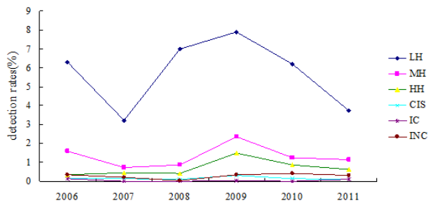
Figure 2. Time Distributions of the Prevalence of Different Diagnosis

et al., 2011) and 0.62% and 2.51% among 3227 people in Cixian (Chen et al., 2008). This is probably because the incidence of EC in Yancheng is lower than that in Linzhou, Feicheng and Cixian (Hao et al., 2012). As can be seen from the screening results, there exist a large proportion of people with precancerous conditions among the high risk populations of EC. If these cases can be detected and treated at an earlier stage, their conditions could then be stopped from further development and the incidence of EC would eventually be reduced.