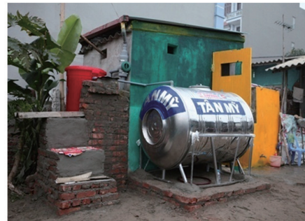
Fig. 2. Rainwater harvesting system using roof and local stainless tank.