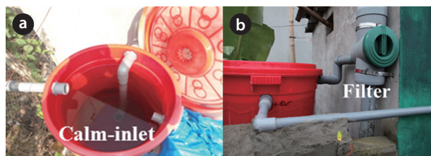
Fig. 4. Calm-inlet (a) and filter (b).

1) Catchment: Since we built the RWH system at existing houses the original roof was used for catchment. The roofing materials include galvanised iron and tile. For houses which do not