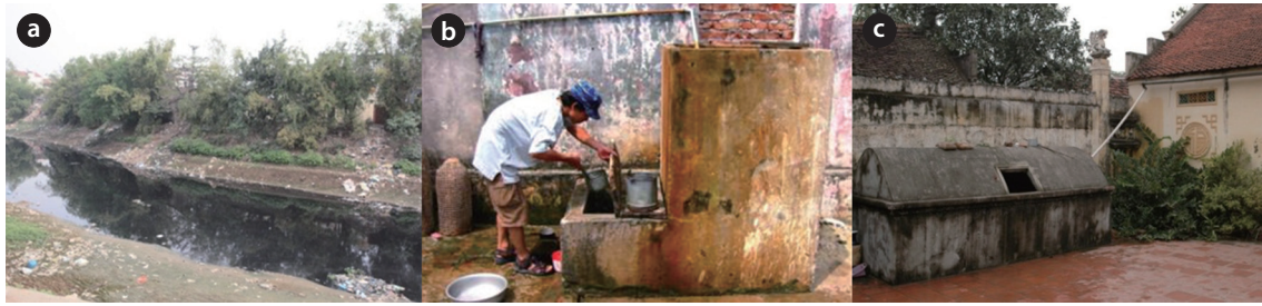
Fig. 3. Water sources in Cukhe village: (a) surface water, (b) groundwater system, and (c) rainwater system.

and groundwater are the main sources used in daily living. Rainwater is the most trusted source and groundwater is the most untrusted source for drinking. The reason why people do not trust groundwater is that arsenic pollution of groundwater has been recognized in the area. Therefore, if the performance of the RWH systems is successful and efficient, and the local community becomes truly aware of its benefits, the concept and use of RWH will spread rapidly, even without the help of any external forces.