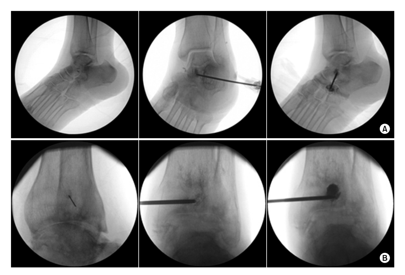
Fig. 2. Intraoperative fluoroscopic images. (Left) A 26-gauge needle was inserted to infuse local anesthetics into the skin over the cyst on the left talus (A) or tibia (B). (Middle) Contrast medium was injected into the osteochondral lesion (OCL) of the left talus (A) or tibia (B) before injection of bone cement, respectively. (Right) The OCLs were filled with bone cement.