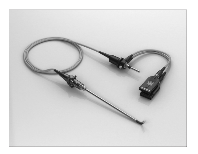
Fig. 4. ENDOEYE FLEX 3D DEFLECTABLE VIDEOSCOPE.

energy and bipolar heat energy and have the potential to surpass the dissection speed of ultrasonic devices with the sealing efficacy of bipolar clamps.<sup>37</sup> THUNDERBEAT may further improve the technical aspects of LG, and lead to reduced operative time and blood loss.