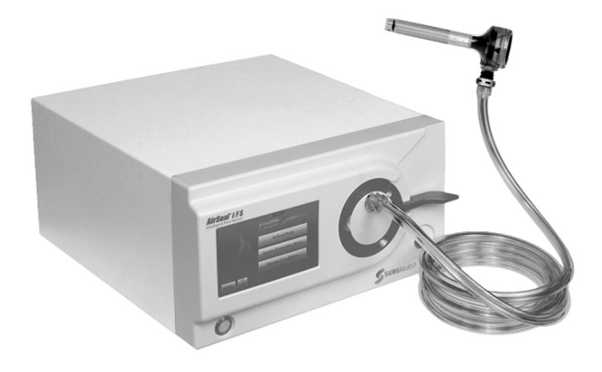
Fig. 5. AirSeal System.

The lack of stereoscopic vision is one of the major factors that make the laparoscopic procedure more difficult and stressful.<sup>38</sup> The up-coming 3D imaging system with ENDOEYE FLEX 3D DEFLECTABLE VIDEOSCOPE (Fig. 4, Olympus Medical Systems Corp) may increase the accuracy of laparoscopy performance, with greater depth perception and only minimal dizziness.