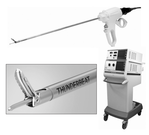
Fig. 3. THUNDERBEAT.