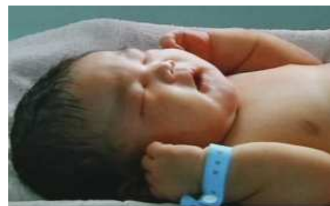
Fig. 2. Tag on Infant’s Hand

Tagging babies is an elusive method followed in many hospitals since its is easily managed and less time consuming.