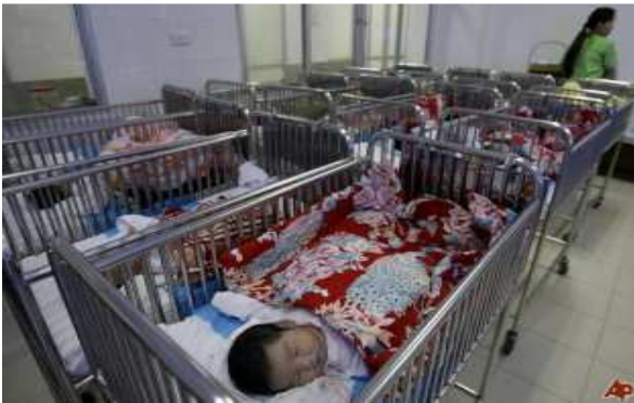
Fig. 3. General Infant's ward of Government Hospital

In some worst cases this may lead to exchanging of babies and the parents might not be aware of it until the DNA test is been taken. It may lead to family disputes in case of further investigation regarding the personal DNA test in future. For this reason each individual baby footprint is separately taken as personal identity so that its stored in the database from which we can recognize the baby easily. In this case fingerprint cannot be opted whereas all the just born palm will be shrunken. Allocating babies individual rooms is very difficult so in order to manage it in groups high authentication should be implied.