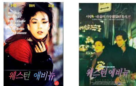
Fig. 1. <Posters of Western Avenue >

This paper aims to review the black-Korean conflict during the 1992 L.A. riots in a Korean movie, Western Avenue (1993). Western Avenue , directed by Gil-Su Jang, is a film that narrates the despair of Korean Americans in the context of the L.A. riots, while placing American ideologies on trial. It is the only feature-length film to portray the story of Korean Americans in the L.A. riots. No other such movie has been made in Korea. [4] This movie could be an instance to look into how conventional elements of racial relations in the U.S. were intertwined in the life of Korean Americans. This paper will first examine some of the factors that resulted from the 1992 L.A. riots before the discussion of Western Avenue . Then, the paper analyzes the story of the Korean American in the film, focusing on how this film deals with the black-Korean conflict during the 1992 L.A. riots.