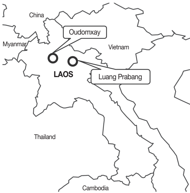
Fig. 1. The surveyed area in Lao PDR for human neurocysticercosis, Taenia solium , and porcine cysticercus infection.

For molecular typing of T. solium metacestodes collected from a pig in the same locality of Oudomxay Province (Fig. 1), PCR-amplified fragments of cox1 were directly sequenced. The prim-