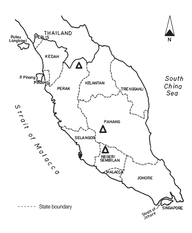
Fig. 1. Map showing the location of the villages in Peninsular Malaysia involved in the study (triangles).

performed. Approximately 5 g of each stool sample was kept into a 15-ml centrifuge tube containing 3 ml polyvinyl alcohol. The samples were subjected to modified trichrome staining [4], while another half of the samples were kept unfixed and stored at 4°C upon arrival at the laboratory for further analysis by formalin-ether concentration [5]. Samples were considered microscopically positive if cysts and/or trophozoites of E. histolytica/dispar/moshkovskii were detected in at least 1 of the 2 techniques and negative if absent in all 2 techniques.