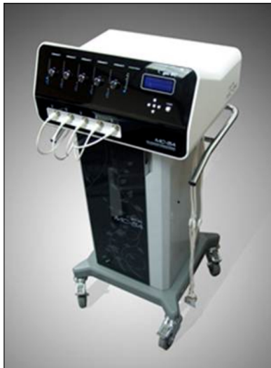
Fig. 1. MC5-A Model. Calmare ® consists of a multiprocessor with five channels capable of treating five painful areas in the same patient simultaneously.

to take several oral medications including pregabalin 150 mg- and oxycodone 10 mg -twice a day, and nortriptyline 75 mg before sleep. Additionally, she had been treated with an epidural block, pulsed radiofrequency lesioning, intravenous lidocaine and ketamine infusion, etc. However, her symptoms were gradually aggravated in spite of all this and her pain was rated at an intensity of 7/10 on the visual analogue scales (VAS) from 0 (no pain) to 10 (worst pain imaginable). Thus, we considered the use of Scrambler Therapy for pain relief. With informed consent, we began to treat the patient (Fig. 2). It was programmed for a 50-minute daily treatment for 10 consecutive days. Before the Scrambler Therapy was initiated, the VAS score was 7/10 and total pain rating index (T-PRI) on the Short-Form McGill Pain Questionnaire (SF-MPQ) was 30/45. After the second treatment, the VAS score was 4/10 and T-PRI on the SF-MPQ was 20/45. Moreover, she reported that the electric shock-like pain decreased to a tolerable range. On the last day, the VAS score was 3/10 and T-PRI on the SF-MPQ was 19/45. In addition, the electric shock-like pain disappeared completely. During ten treatments, no side effects were reported. On the third day after the last treatment, she received one more therapeutic treatment for pain relief. From that day, the VAS score was maintained within the range of 3-4 for the next 2 weeks. Four weeks later, at the patient's follow up visit, the VAS score was 4.