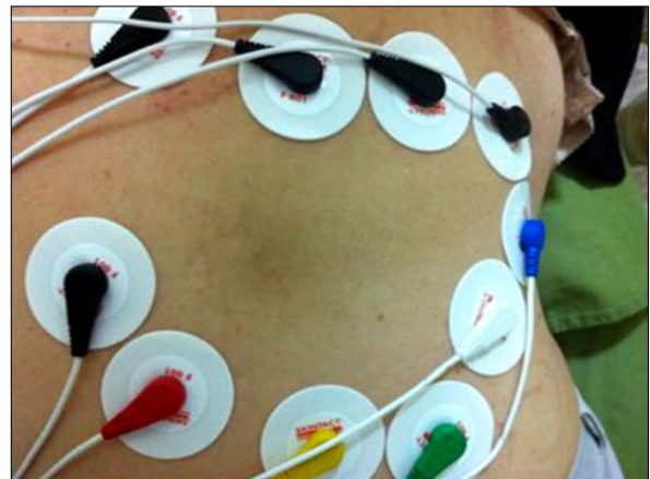
Fig. 2. A patient complained of pain in the right scapular area around the T3 dermatome. We applied each of 2 surface electrodes in five channels on the skin around the painful areas, not in the painful areas.

to take several oral medications including pregabalin 150 mg- and oxycodone 10 mg -twice a day, and nortriptyline 75 mg before sleep. Additionally, she had been treated with an epidural block, pulsed radiofrequency lesioning, intravenous lidocaine and ketamine infusion, etc. However, her symptoms were gradually aggravated in spite of all this and her pain was rated at an intensity of 7/10 on the visual analogue scales (VAS) from 0 (no pain) to 10 (worst pain imaginable). Thus, we considered the use of Scrambler Therapy for pain relief. With informed consent, we began to treat the patient (Fig. 2). It was programmed for a 50-minute daily treatment for 10 consecutive days. Before the Scrambler Therapy was initiated, the VAS score was 7/10 and total pain rating index (T-PRI) on the Short-Form McGill Pain Questionnaire (SF-MPQ) was 30/45. After the second treatment, the VAS score was 4/10 and T-PRI on the SF-MPQ was 20/45. Moreover, she reported that the electric shock-like pain decreased to a tolerable range. On the last day, the VAS score was 3/10 and T-PRI on the SF-MPQ was 19/45. In addition, the electric shock-like pain disappeared completely. During ten treatments, no side effects were reported. On the third day after the last treatment, she received one more therapeutic treatment for pain relief. From that day, the VAS score was maintained within the range of 3-4 for the next 2 weeks. Four weeks later, at the patient's follow up visit, the VAS score was 4.