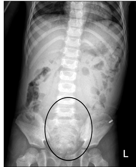
Fig. 1. Simple abdominal X-ray shows faint rectal gas and a large amount of fecal materials in the distal colon (circle).

Radiologic and laboratory findings: Abundant fecal materials were observed on abdominal X-ray (Fig. 1), and ultrasonography (USG) of the abdomen