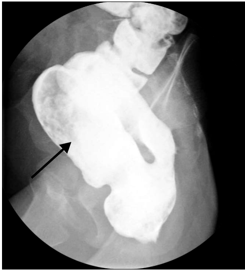
Fig. 4. The giant Duhamel pouch with fecal materials (arrow) without stenosis of the anastomotic site was noted on the colon study.

giant Duhamel pouch, an unidentified membranous tissue and to perform a full-thickness rectal biopsy. Two weeks later, operation was done after sufficient evacuation of the feces in her rectum. A septum was noted in Duhamel pouch, which ran transverse direction in her rectum on the operative findings. Post-Duhamel septum revision was performed. Histopathologic findings of the full-thickness rectal biopsies showed a ganglion cell in the rectum. Since the operation, she has been visiting our outpatient clinic regularly. She has been free of defecation and urination difficulties without the need for medicine.