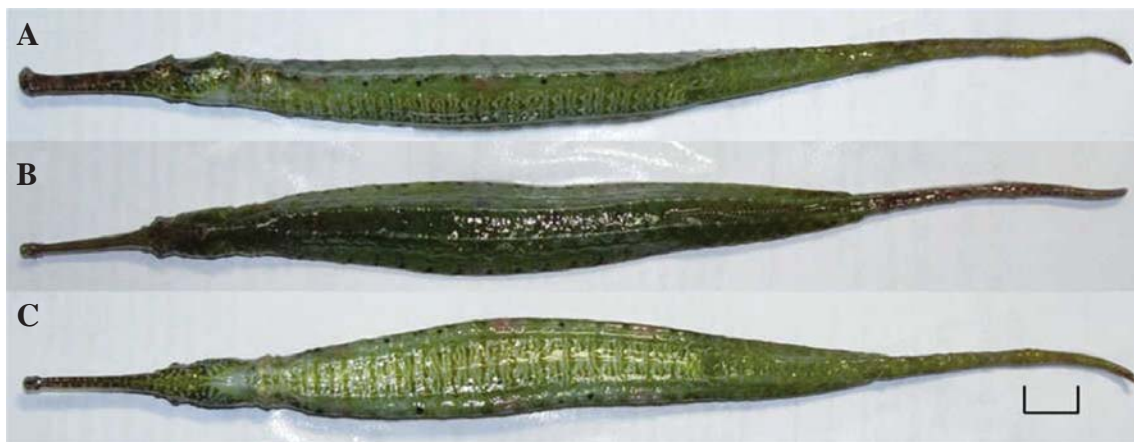
Fig. 1. Photograph of Syngnathoides biaculeatus from Jisepo bay in Geoje Island, Korea, GSNU 051014-1, 226.5 mm TL. Scale bar indicates 10 mm. A. Lateral view; B. Dorsal view; C. Ventral view.

Remarks. Following Dawson (1985), the present species is identified as a member of the species Syngnathoides . The genus and species has not been reported in Korea until now. But this was already reported in China (Chu et al. , 1962; Cheng and Zheng, 1987) and Japan (Araga, 1981; Araga, 1984; Senou, 2000) and Taiwan (Shen et