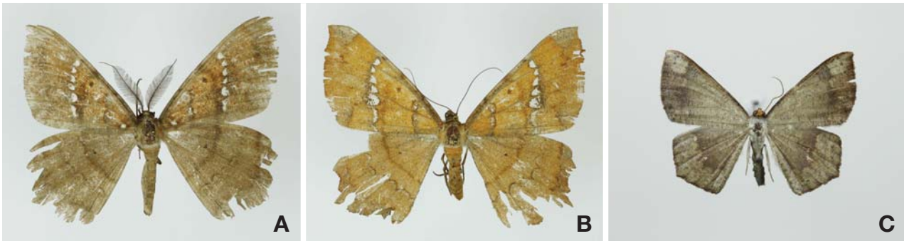
Fig. 1. Adult of Amblychia angeronaria and Peratostega deletaria in Korea. A, Amblychia angeronaria (male); B, Amblychia angeronaria (female); C, Peratostega deletaria .