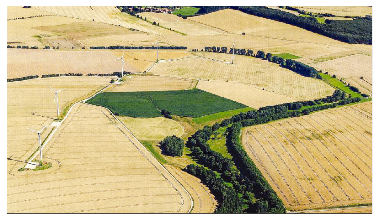
Fig. 4. The German Green Belt

The production share of environmental protection goods in relation to all industrial products has increased in Germany from 4.7% in 2002 to 5.7% in 2009. From 1993 to 2009 the global share of exported German environmental goods was nearly constant, whereas the export from other countries, such as United States, Japan, United Kingdom and France less or more dramatically dropped (Schasse, Gehrke and Ostertag 2012). It has been estimated that the number of newly created jobs in Germany in the renewable energy sector was more than 200,000, starting from 160,500 in 2004 to about 367,400 in 2010 (Federal Environment Agency 2012). In 2010 the expenditure for renewable energy plants in Germany was about €27 billion (GFME 2011).