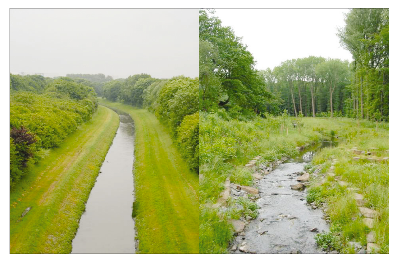
Fig. 3. Emscher river before (left) and after (right) its renaturation in the city of Dortmund

One of the most outstanding revitalization projects in Germany is the Emscher renaturation, which is a paradigm for the new trend of taking into account challenges of sustainability as well as climate change into urban development. This project is focussed on the renaturation of the 80 km long Emscher river, which has been used as sewer for more than hundred years. The €5 billion project aims at establishing a huge landscape park instead of the old open sewer system. Emscher landscape park will comprise cooling green spaces, areas for flood control, recreation areas and habitat network and therefore enhance life quality in Ruhr metropolitan area, especially under future climate conditions (Gruehn 2010). Fig. 3 points out how the Emscher water course has changed after the renaturation during the last couple of years. The efforts which have been undertaken in the Ruhr region in the last decades did not only contribute to the structural change in terms of economics but also to a positive mental change how people perceive the region.