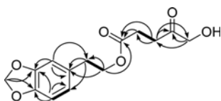
Figure 2. Selected HMBC (↷) and ^1\text{H} - ^1\text{H} COSY (—) correlations of compound 1 .

proton signals ( \delta_{\text{H}} 5.82, 5.87 s) with C-3 ( \delta_{\text{C}} 147.0) and C-4 ( \delta_{\text{C}} 145.7) revealed that the exist of a 3,4-methylenedioxyphenylethanoid structural unit. 13 In addition, the ^1\text{H} - ^1\text{H} COSY of H-2'/H-3' together with HMBC correlations of H-5' ( \delta_{\text{H}} 4.49) with C-4' ( \delta_{\text{C}} 210.1), C-3' ( \delta_{\text{C}} 33.1), of H-3' ( \delta_{\text{H}} 2.84) with C-1' ( \delta_{\text{C}} 172.5), C-2' ( \delta_{\text{C}} 28.0), C-4' ( \delta_{\text{C}} 210.1), C-5' ( \delta_{\text{C}} 68.5), of H-2' ( \delta_{\text{H}} 2.69) with C-1' ( \delta_{\text{C}} 172.5), C-3' ( \delta_{\text{C}} 33.1), C-4' ( \delta_{\text{C}} 210.1) also suggested that the exist of a 5-hydroxy-4-oxoamylacyl group (-OC(O)-CH 2 CH 2 C(O)CH 2 OH). 14 The HMBC of H-8 ( \delta_{\text{H}} 4.32) with C-1' ( \delta_{\text{C}} 172.5) indicated that the 5-hydroxy-4-oxoamylacyl group located at C-8. Thus, the structure of 1 was established and given the name as rugethanoid A.