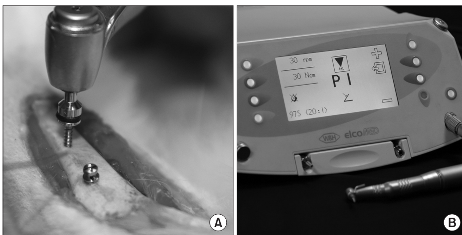
Fig. 2. Insertion procedure of orthodontic mini-implant and equipment. A. Pre-drilling with saline irrigation. B. Surgical engine which can measure and record the torque. Odontuya Gansukh et al: Effect of rotation bump on removal torque of orthodontic mini-implants. J Korean Assoc Oral Maxillofac Surg 2013

The mini-implants were removed at two weeks and four weeks after implantation, with the torque recorded by the surgical engine (Fig. 2. B), which had a rotational speed of 20 rpm. Impdat software (Kea Software GmbH, Poeking, Germany) was used for the readout of the removal torque value. The torque was recorded eight times per second. MIT, MRT