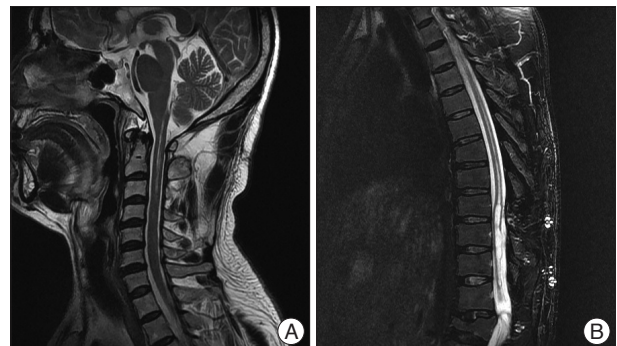
Fig. 3. Postoperative magnetic resonance images of cervical (A) and thoracic (B) at 27 months after the surgery show considerable reduction in the size of the syringomyelic cavity.