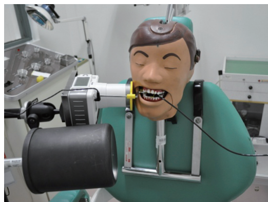
Figure 4. Operator's radiation dose was measured by an ionization chamber at the operator's hand level using the portable dental X-ray machine without a lead shield.