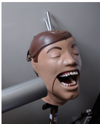
Figure 1. Human skull phantom DXTRR III.

Dose measurements were conducted using a Human skull DXTRR III (Dentsply Rinn, Elgin, IL, USA) (Figure 1) and were recorded using an ionization chamber (Medical X-ray system test equipments Model 9015RM with 1,800 chamber, RadCal Corp., Monrovia, CA, USA) (Figure 2).