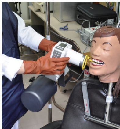
Figure 6. Scattered radiation dose was measured by an ionization chamber at the operator's waist level.