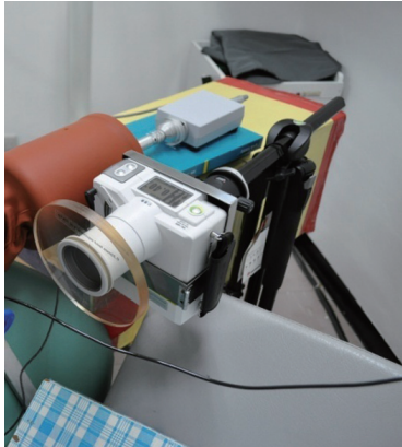
Figure 5. Portable dental X-ray machine with a lead shield.