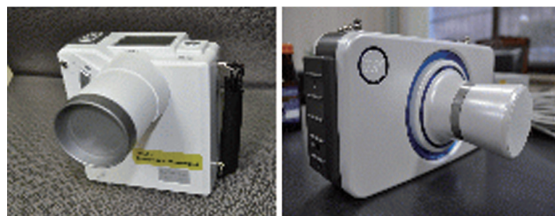
Figure 3. Two kinds of portable hand-held X-ray machines (Left-DX3000; Right-Rextar).

Dose measurement was carried out at the operator's hand level during the exposure of lower anterior and posterior teeth, with and without a lead backscatter shield attached at the end of cone. The setting for exposure was 60 kVp, 1 mA and 0.4 seconds for the lower anterior teeth, 0.8 seconds for the lower posterior teeth using digital sensor (Figures 4 and 5).