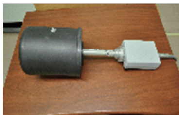
Figure 2. An 1,800 cc ionization chamber for low-level radiation measurement.