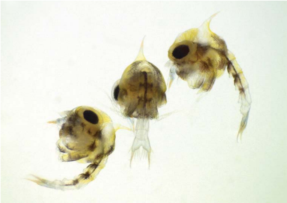
Fig. 1. Leptomithrax edwardsii , first stage zoeas, live specimens.

terodorsal setae, pleomeres 3-5 with long posterolateral processes, progressing reduced in size; pleopod present as buds without endopods.